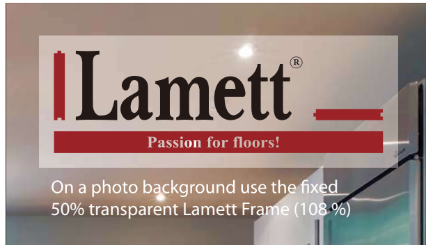
On a photo background use the fixed 50% transparent Lamett Frame (108%)