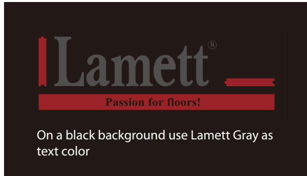
On a black background use Lamett Gray as text color