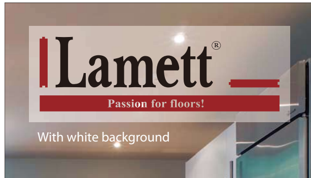
With white background